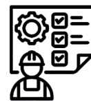
Preventive Maintenance & Commissioning