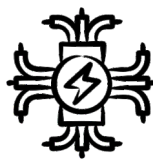
Cables & wiring Installations