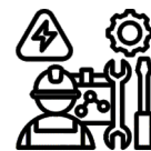
Field Service And Troubleshooting