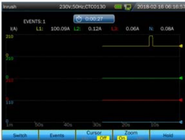
Representation of NP45 screen

Using the arrow keys in the inrush current function the trigger limits: expected inrush time, nominal current, threshold and hysteresis can be adjusted. The maximum current determines the vertical height of the current display windows.