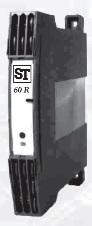
Fig. 2 Theta R, 2 channel version, in housing S17 hole mounting brackets pulled out.

The transmitter Theta 60R (Fig. 1 and 2) Converts the input variable-a signal from a resistance thermometer Pt 100- to a temperature linear output signal.