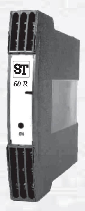
Fig. 1 Theta R, 1 channel version, in housing S17 clipped on to a top - hat rail.