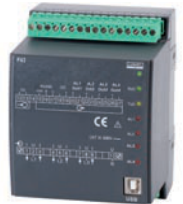
P43 - three-phase transducer of power network parameters.